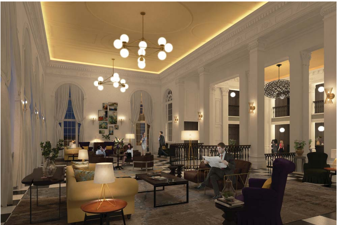
EXTERIOR CONCEPT RENDERING OF HOTEL ►