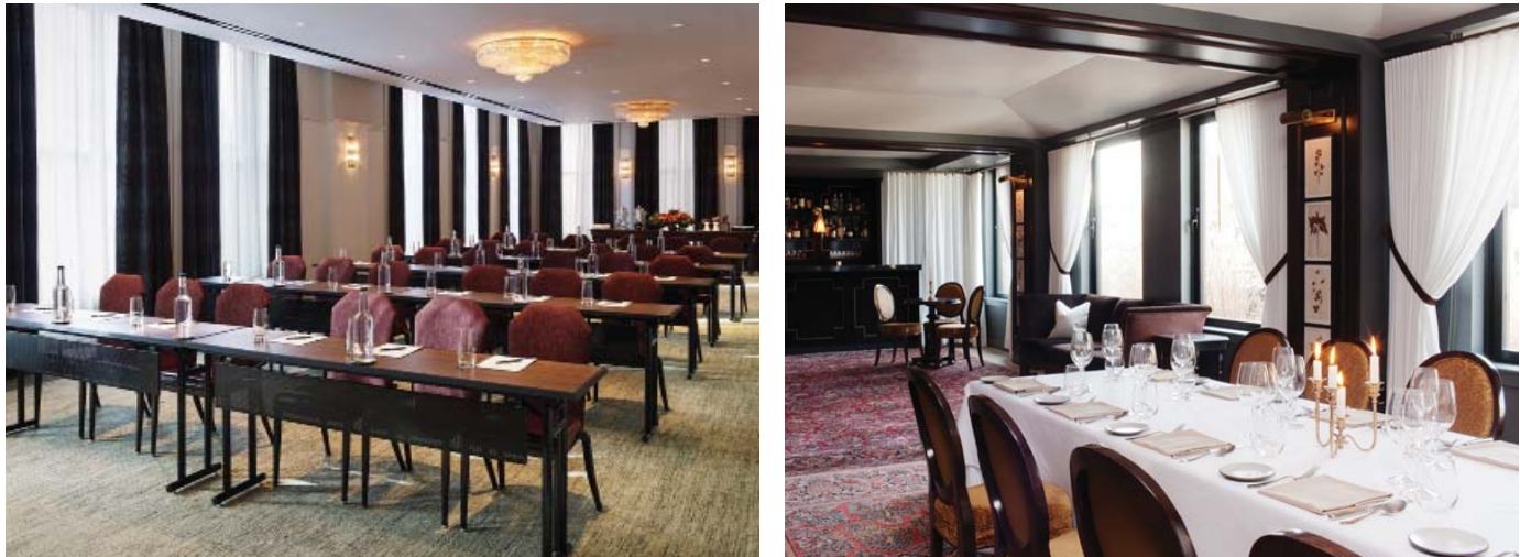
CONCEPT FOR CONFERENCE SPACE