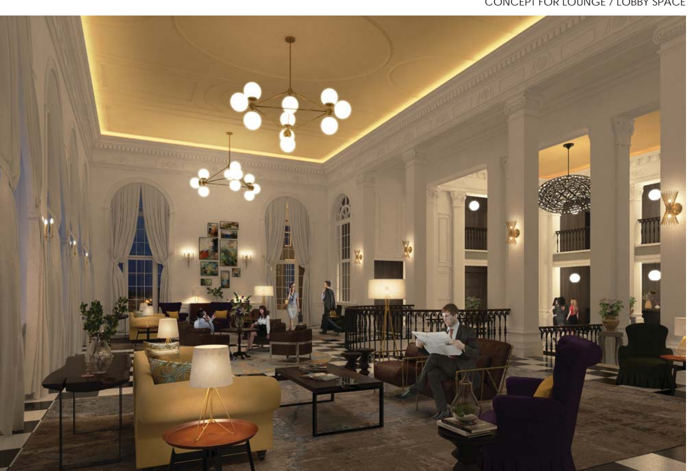
CONCEPT FOR LOUNGE / LOBBY SPACE